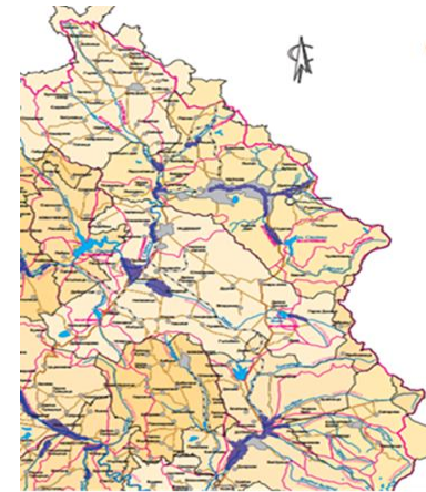
ОБЗОРНА КАРТА НА РАЙОНИ С ПОТЕНЦИАЛЕН РИСК ОТ НАВОДНЕНИЯ В ЗАПАДНОБЕЛОМОРСКИ РАЙОН М 1:200 000

The document aims to create a model for cross-border cooperation between the two municipalities, which will, in case of successful implementation, achieve improvement of the environmental conditions of the surrounding environment, in particular, water. It will reduce the negative consequences of possible floods. The model might be used as good practice in other cross-border areas.